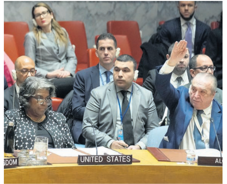
Algerian Ambassador to the United Nations Amar Bendjama, right, votes to approve a resolution concerning a ceasefire in Gaza while Linda Thomas-Greenfield, United States Ambassador to the U.N., left, looks on during a Security Council meeting at United Nations headquarters, Tuesday, Feb. 20, 2024.

The Arab draft would also have demanded the immediate release of all hostages, rejected the forced displacement of Palestinian civilians, called for unhindered humanitarian access throughout Gaza, and reiterated council demands that Israel and Hamas "scrupulously comply" with international law,